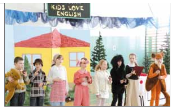
ized within the Program. Fifty-nine Teaching English Teachers weekend training courses for 2,300 teachers, mainly from outside big cities, were conducted.

Language training courses and language camps were organ-